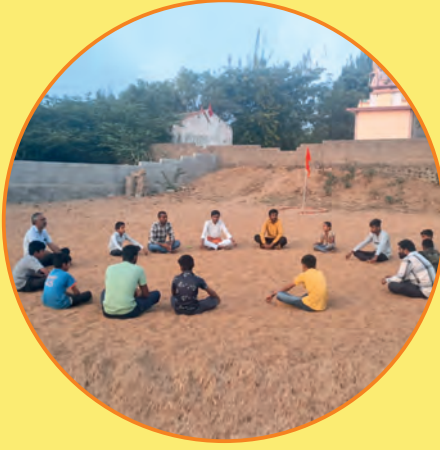
विद्यार्थी शाखा ग्राम-कपुराशी, जिला-कच्छ

शाखा में हम ऐसे खेले जिससे प्रेम उमडता हो कुछ बौद्धिक हो गीत गान हो धर्म ज्ञान की चर्चा हो भगवा ध्वज हो नित्य सामने त्याग भावना पलती है ॥