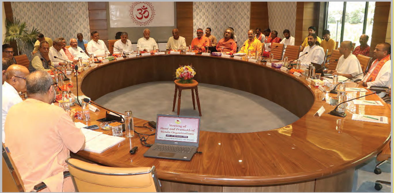
हिंदू समाज के विविध विश्वविख्यात संगठनों के प्रमुखों की बैठक, मुंबई, जनवरी 2025 में पू. सरसंघचालक जी व अन्य प्रमुख