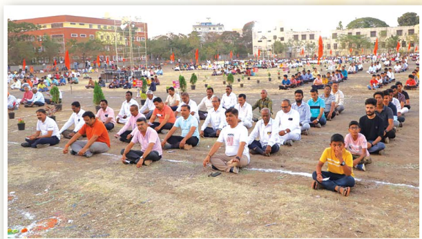
Devgiri, Latur Shakha Sangam

Malva - Short Term Vistarak Yojana - It was resolved to send Vistaraks to every village. The Vistaraks were expected to start a Shakha, Milan or Mandali in the village in seven days and set up a team that could run it permanently. Also, 16 assignments including wall writing, village meeting, discussion of village development and social change, contacting influential persons etc. were given to the Vistaraks. Mandal Sashaktikaran Vargs were held in 1044 Mandals before the Vistaraks were sent to the villages. 17,250 Swayamsevaks were present from