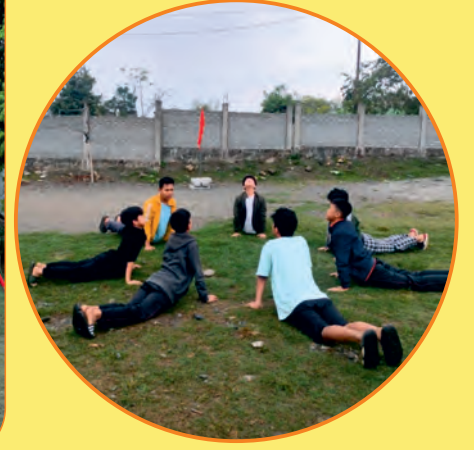
विद्यार्थी शाखा रोइंग, अरुणाचल प्रदेश