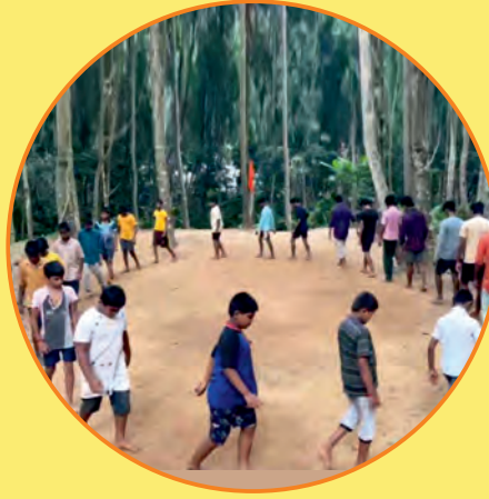
विद्यार्थी शाखा ग्राम-कावुथिट्टे, जिला-कन्याकुमारी

100 वर्ष पूर्व पू. डॉ. हेडगेवार जी ने यह संस्कार साधना प्रारंभ की थी । आज देश के कोने-कोने में यह साधना अखंड चल रही है ।