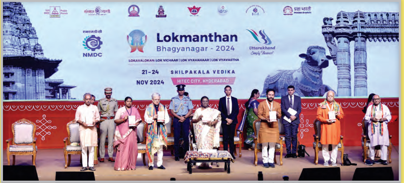
लोक मंथन कार्यक्रम में आदरणीया राष्ट्रपति श्रीमती द्रौपदी मुर्मू जी, पू. सरसंघचालक जी एवं अन्य महानुभव