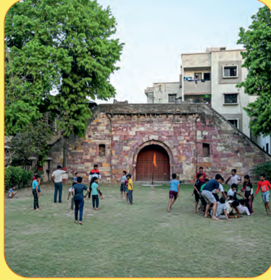
मोहिते विद्यार्थी शाखा, नागपुर