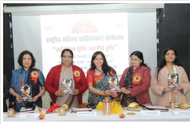
Women's literary conference Bhopal

were held in Mangalore, Indore, Katni, Sikar, Bharatpur, Sanganeer, Rajsamand, Jodhpur, Darbhanga, and Guwahati. In the women's literary conference held in Bhopal, 121 women writers participated.